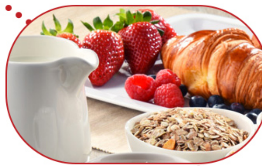
Food and Beverages