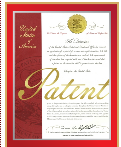
US Patent Letter of Amarantha CurQmint Chewable Tablet