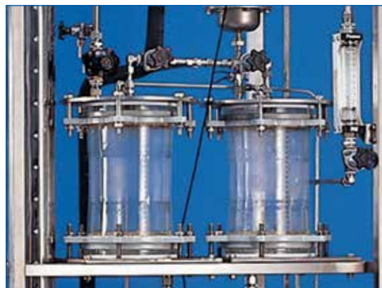
Receiver vessels being cleaned using integral CIP facility.