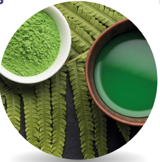
LIQUID & POWDER FLAVOURS