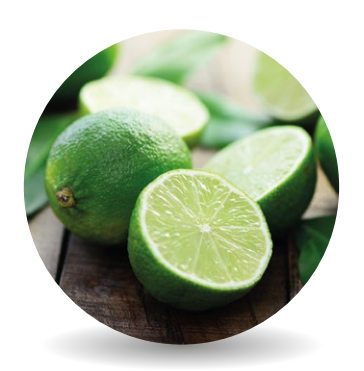
FLAVOURS & NATURAL FLAVOURS