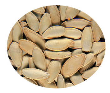
Pumpkin Seads Salted and Roasted