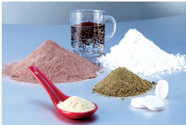
Spray agglomeration helps to form porous, optimally dispersible granules from powders that are dust-free and easy to dose and tablet.

The principle of agglomeration, also known as build-up agglomeration, is based on the formation of solid bridges that connect loose particles together and allow the grain-on-grain growth of larger, loosely structured particles. Powdered particles are first wetted using a liquid, steam or both, and the bridges, formed by a chemical bond, crystallize and harden during the drying process. Naturally occurring electrostatic and van der Waals forces also play an important role.