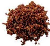
Red Quinoa, ref. 2052