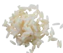
Organic white rice, ref. 3000