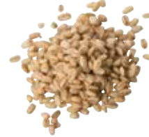
Pearled Barley, ref. 2060