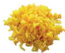
Saffron rice, ref. 2665