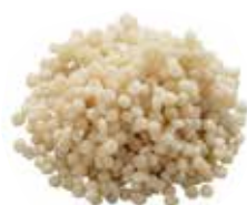
Giant couscous, ref. 2085