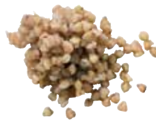
Buck Wheat, ref. 2045