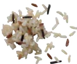
Mix White, Red, Brown rice, ref. 2346