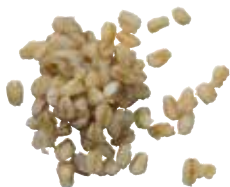
Whole wheat, ref. 2023