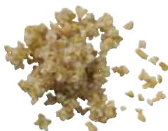
Bulgur, ref. 2030