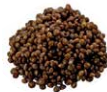
Beluga lentils, ref. 2090