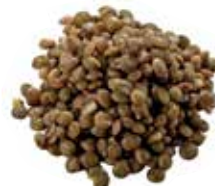
Small Green Navy Lentils, ref. 2078