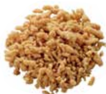
Hydrated pea protein flakes, ref. 1065