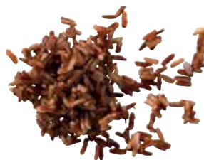
Red rice, ref. 2350