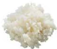
Sushi rice, ref. 2000