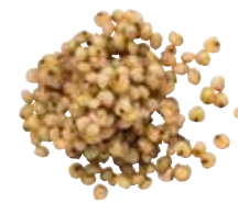
Sorghum, ref. 2038