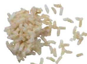
Brown rice, ref. 2520