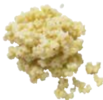
Millet, ref. 2048