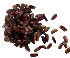
Black rice, ref. 2370