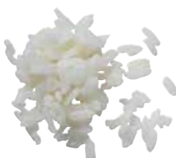
Arborio rice, ref. 2013