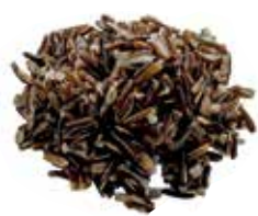
Wild rice, ref. 2300