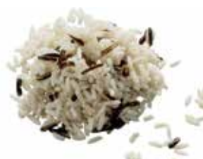
Wild and white rice mix, ref. 2810