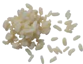
St. Andrea rice, ref. 2012