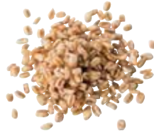
Spelt, ref. 2040