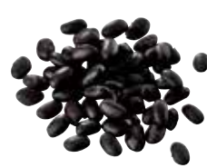
Black beans, ref. 2700