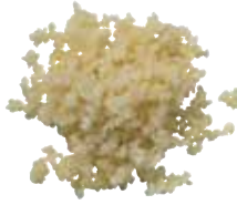
Couscous, ref. 2080