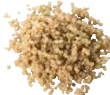
Golden Quinoa, ref. 2050