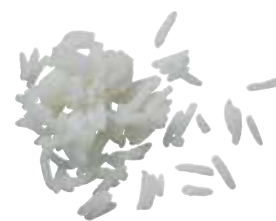
Basmati rice, ref. 2430