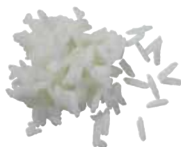
Jasmin rice, ref. 2420