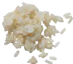
Ribe/loto rice, ref. 2010