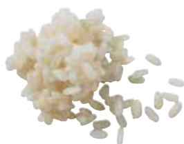
Guardimar rice, ref. 2025