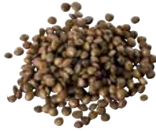
Green lentils, ref. 2076