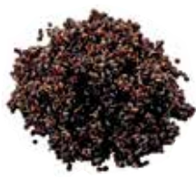
Black Quinoa, ref. 2049