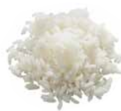
Puntal rice, ref. 2210