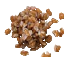
Farro, ref. 2046