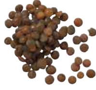
Brown lentils, ref. 2075