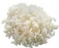
Carnaroli rice, ref. 2033