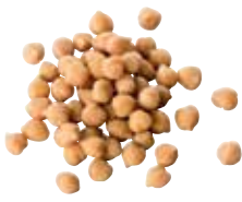
Chickpeas, ref. 2600