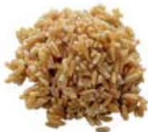
Oat, ref. 2070