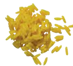
Organic yellow rice, ref. 3100