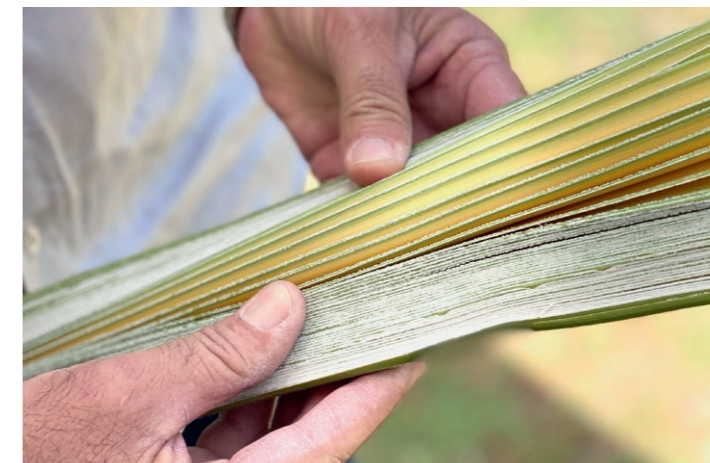
Waxes from Brasil

Sweets, cosmetics or pharmaceuticals: our raw materials improve other products.