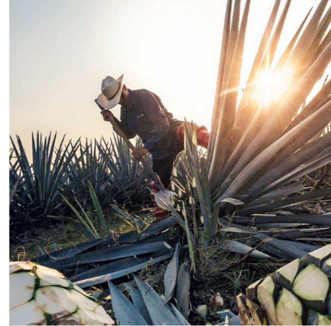
Agave and honey from Mexico

Our subsidiaries in Hungary, Mexico, Argentina, China and Singapore provide a global consulting and service team.