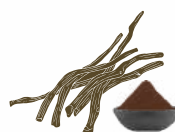
WITHANIA SOMNIFERA (ASHWAGANDHA)