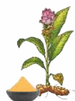
CURCUMA LONGA (TURMERIC)