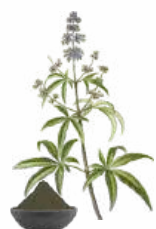
ANDROGRAPHIS PANICULATA (KALMEGH)

KPPE has setup a state-of-art large GMP compliant manufacturing facility near Mumbai, India. It has the most modern processing equipments, analytical and process development laboratories, micro-bio laboratory with supporting documentation processes that provides end-to-end traceability. Materials procurement and subsequent conversion meticulously adheres to sustainability. The facility has dedicated team members of various departments comprising of production, quality control, quality assurance and regulatory. The end goal is to make authentic ingredients for most reliable applications.