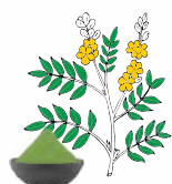
CASSIA ANGUSTIFOLIA (SENNA)