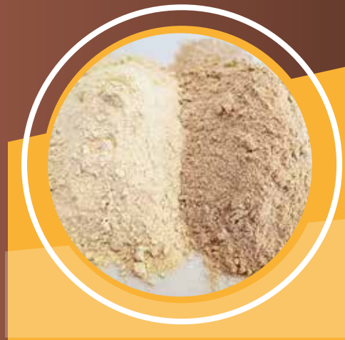
Teff flour, white and brown