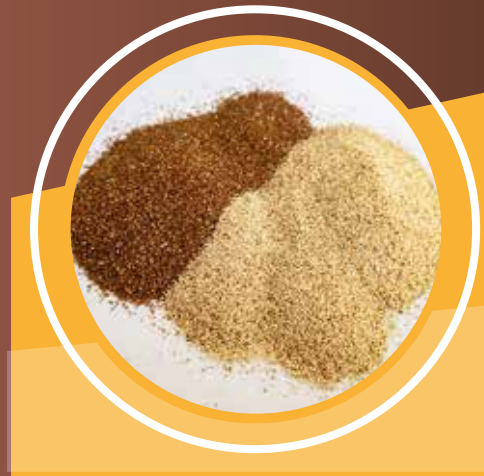
Teff grain, brown and white

Coarse flakes - For customers not in need of a very thin flake we have a coarser version, for example for energy, fitness, or any other type of bars.