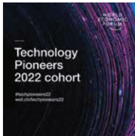
World Economic Forum Technology Pioneers 2022